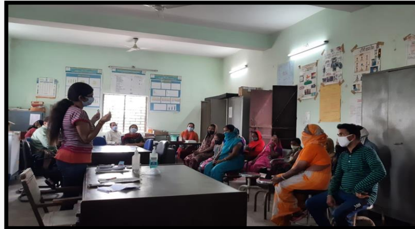
Health talk on Family Planning Methods