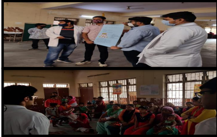
Health talk on Anaemia