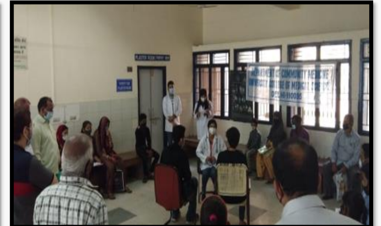
Role Play on World TB Day