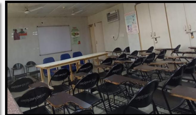
DEPARTMENTAL LIBRARY-CUM-SEMINAR ROOM